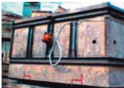
Compacting of moulding sand