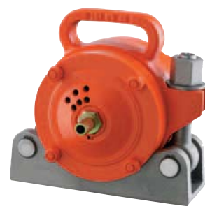
NVT with bracket NVH 4